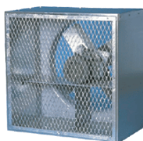
galvanized rear sleeve