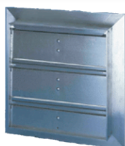
back draft damper / shutter