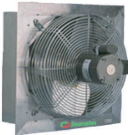
Direct Drive Series DW