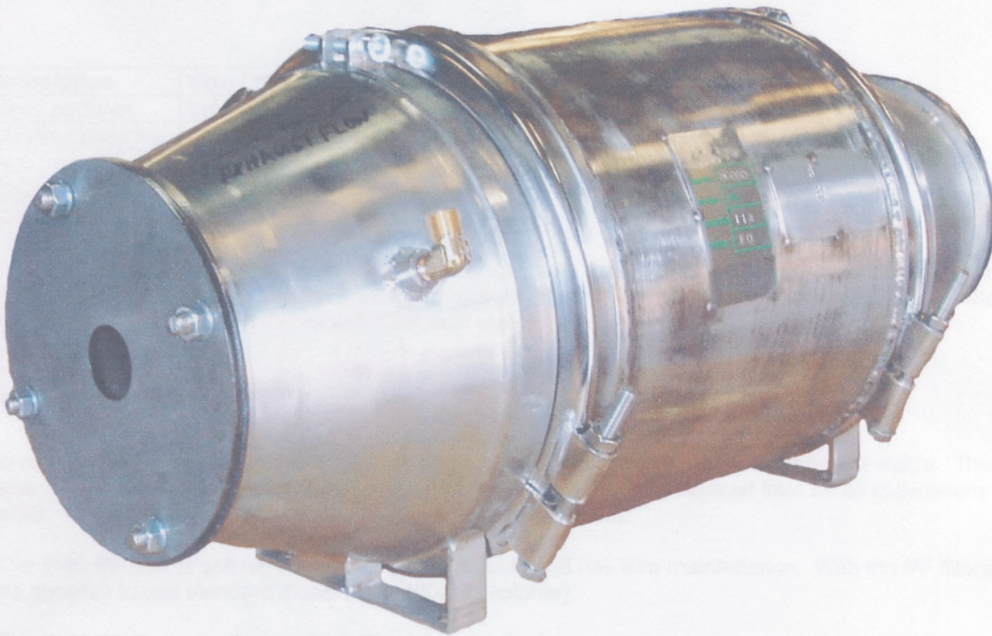
Particle Filter with Catalyst for Diesel Exhaust Fumes